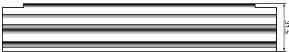
Terminal foot definition